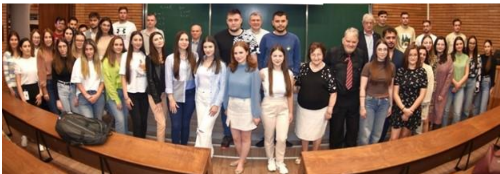
Opening of the academic year 2023/2024 for the 27th promotion of the ICSFET master's program

Regarding the domain of safety / security - the field of interest of IJISC - the first notions in this sense were introduced in the graduate and postgraduate** courses taught in the faculty since the end of the 70s. Later, with the restructuring of master's programs in accordance with the Bologna cycle at the beginning of the 2000s, different master's programs included more and more concepts and courses in these fields.