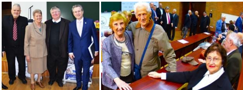
The “FETIT-70” Gala, an opportunity to meet colleagues from different generations, to debug memories...

The size of the research is revealed by the multitude of national and international scientific research contracts solved, by the numerous patents, books and studies with authors from FETIT. An argument for the scientific value is also represented by the hundreds of doctorate titles awarded under the coordination of the teaching staff of the faculty.