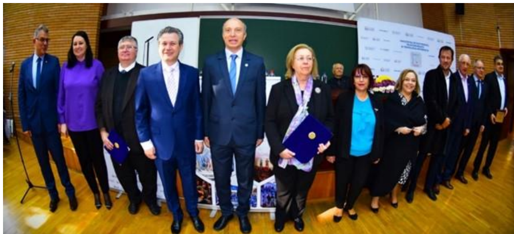
Members of the management of NUST "Politehnica" participating in the Gala "FETIT-70"

Some of these professors, whose life and activity were intertwined for a long period of time with the history and evolution of the faculty, were rewarded by the management of the university and the faculty with Honorary Diplomas for their entire activity.