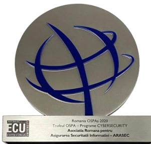
OSPA 2020 for the best Romanian cybersecurity initiative

The Romanian Association for Information Security Assurance (RAISA) won the Outstanding Security Performance Awards (OSPA) 2020 for the best Romanian cybersecurity initiative, with the " Considerations on Challenges and Future Directions in Cybersecurity " study.