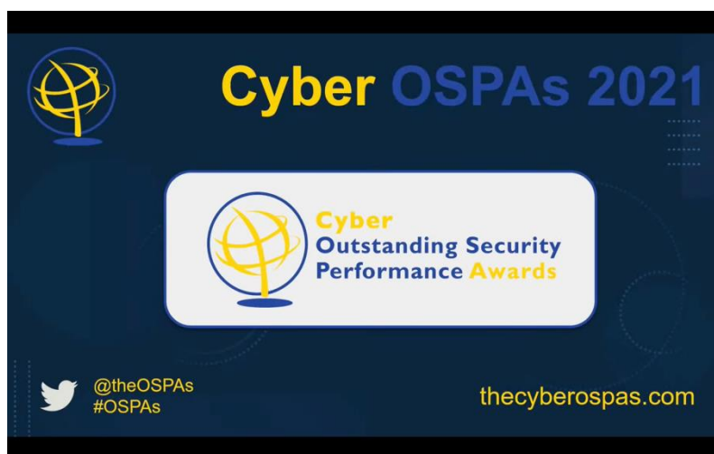
Cyber Outstanding Security Performance Awards 2021

The first-ever Cyber Outstanding Security Performance Awards (Cyber OSPAs) have been launched in 2021 to recognise and highlight outstanding performance by companies, people, products, and initiatives across the cyber security sector globally: https://thecyberospas.com/ . The Cyber OSPAs are designed to be both independent and inclusive, providing an opportunity for outstanding performers, whether buyers or suppliers, to be recognised and their success to be celebrated. The criteria for these awards are based on extensive research on key factors that contribute to and characterise outstanding performance.